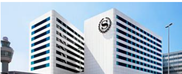
Sheraton Amsterdam Airport Hotel 4-min walk from New Hilton Amsterdam Schiphol € 199/night*