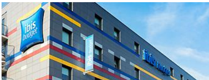
Ibis budget Amsterdam Airport 5 km from Conference Venue – free shuttle for the airport available € 63/night*