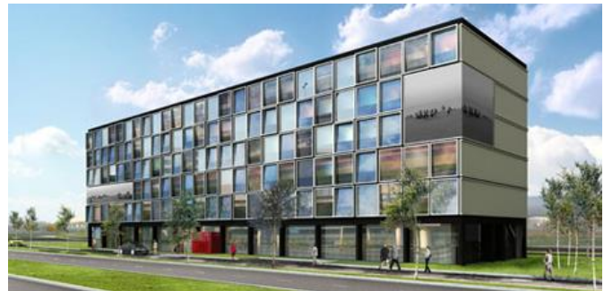
CitizenM Schiphol Airport 7-min walking distance from New Hilton Amsterdam Schiphol € 146/night*